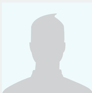
Head of Internal Audit